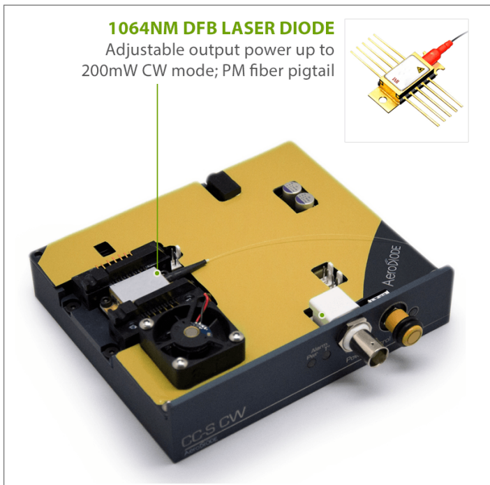
1064NM DFB LASER DIODE Adjustable output power up to 200mW CW mode; PM fiber pigtail