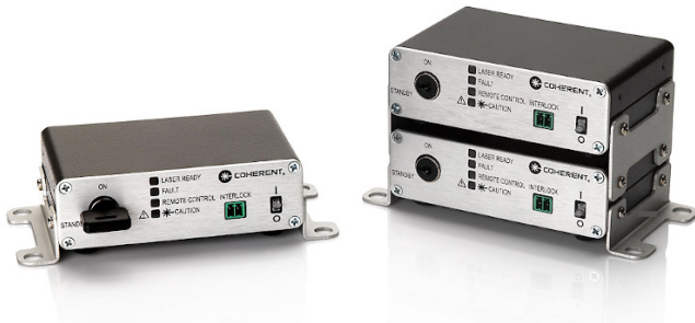
multiple controllers can be securely stacked using the included mounting hardware

control multiple controllers simultaneously using Coherent's software and the convenience of USB