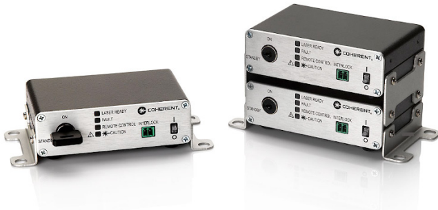
multiple controllers can be securely stacked using the included mounting hardware

control multiple controllers simultaneously using Coherent's software and the convenience of USB