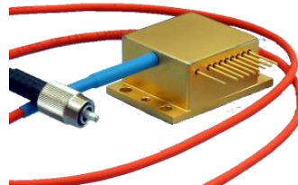
HHL FC Package