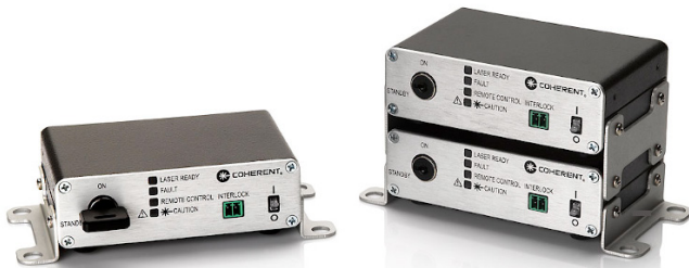
multiple controllers can be securely stacked using the included mounting hardware

control multiple controllers simultaneously using Coherent's software and the convenience of USB