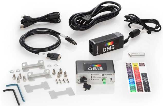
the full kit includes: mounting hardware, laser controller, cables, power supply, and color-coded labels to instantly identify controllers in multi-wavelength applications