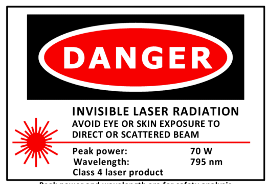
Peak power and wavelength are for safety analysis only, not to present device performance.